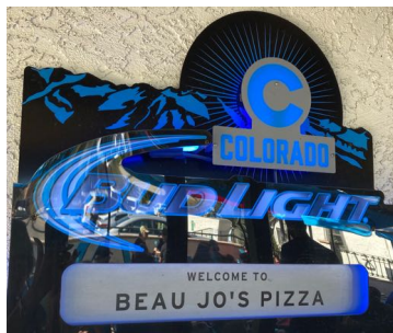
Beau Jo's Pizza