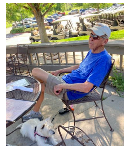
The Den at Fox Hollow golf course