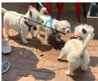
Edgewater Beer Garden