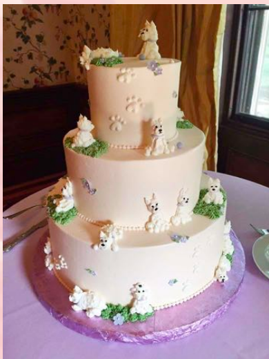
Westie Wedding Cake Credit : Monica Collins