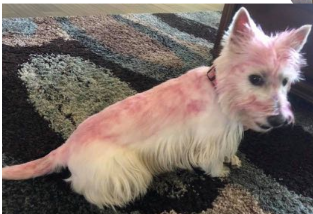
This is Rogue, who happens to be pink today