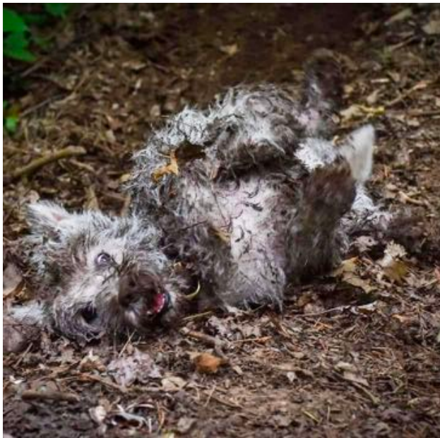
Willie check him out on page 5- never know it was the same dog!