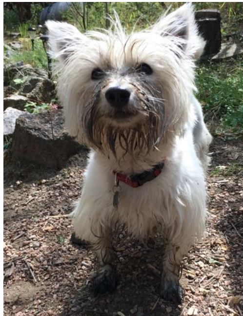
This is Maggie, who also comes in white