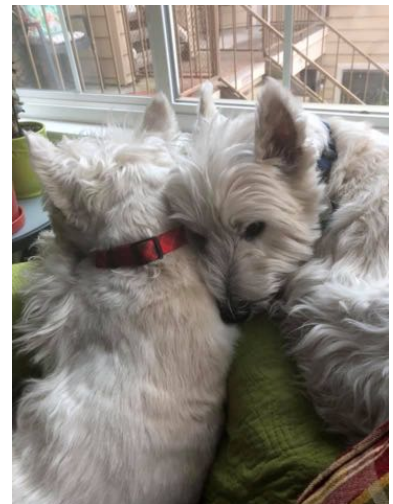
November 2019 Willie and Ollie

I am finally enjoying having Willie around. I still give him the Westie Stink Eye, but I don't really mean it too much. Grrrr.