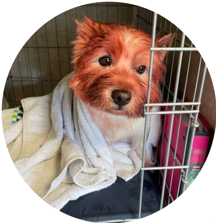
Murray after getting in red ironite- right after grooming