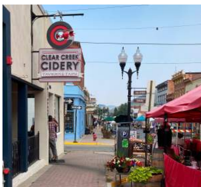
Clear Creek Cidery

They have great sandwiches, and soups. You do have to go inside to order. I met a new WRN Westie puppy here. We Westies did some serious begging, but didn't get anything to sample. We may have to go back, as they have the best ice cream, and are famous for banana bread ice cream sandwich. Yum.