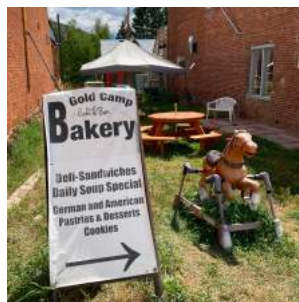
Gold Camp Bakery

Orchard Town Center 14618 Delaware Street, Westminster CO, If you look closely, you will see 4 Westies under the table. It was fun meeting my friends for lunch! We had been here before, but I thought it was time to review this place again. It is the only restaurant I know of that offers a special lunch for pups. I loved it, but one of the Westies with us ate his dog bowl; so I don't think we can go back, even though it is one of my favorites.