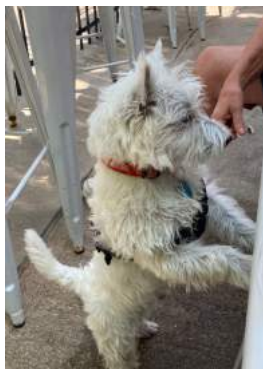
Eats & Sweets

We are still having warm weather days; so take your dog to lunch or out for a beer! Here are some of Maggie's and her friends' favorites.